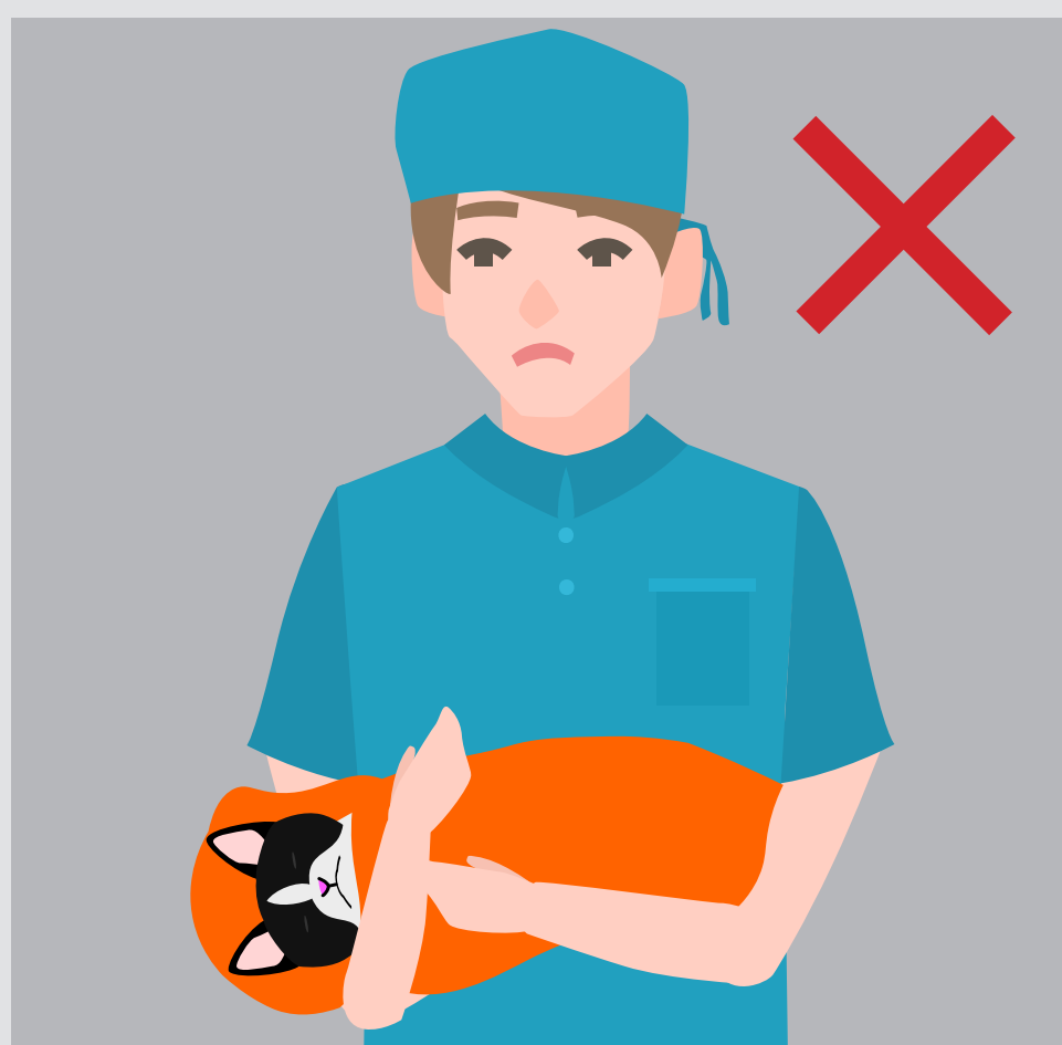
Head Not Supported